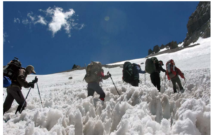
The joy of dancing through snow formations known as 'penitentes'