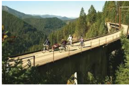
Hiawatha trail near the MT-ID border (see scheduled weekend trip)