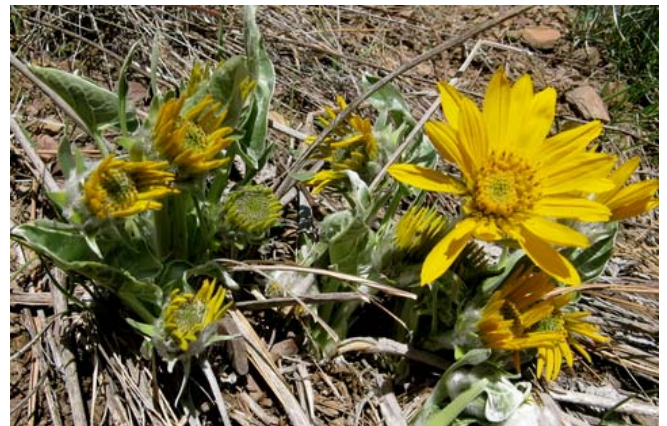
Young Arrowleaf Balsamroot